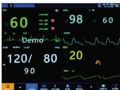
Big font interface